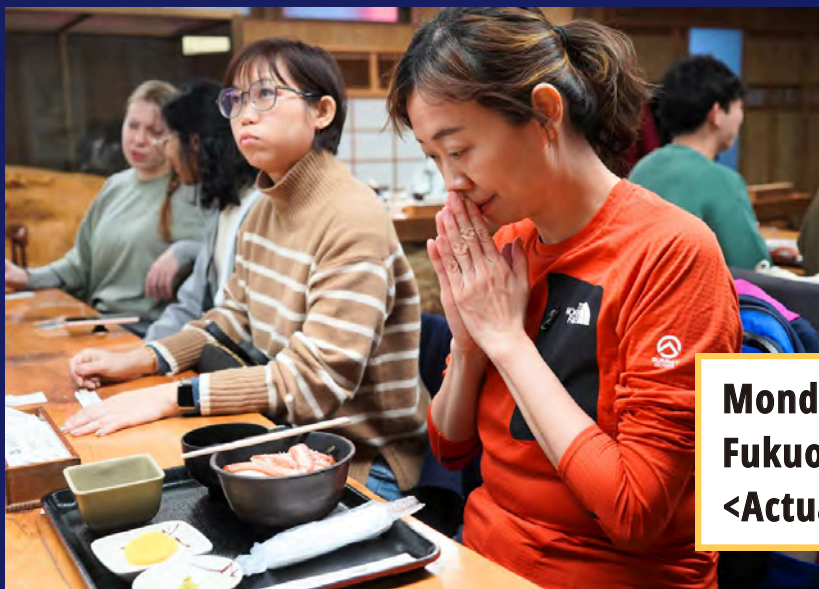
Monday 9th June Fukuoka Specialty Seafood Lunch <Actual Cost>