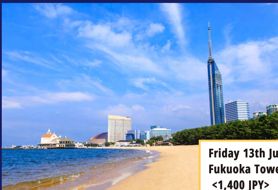
Friday 13th June Fukuoka Tower & Seaside Momochi Park <1,400 JPY>