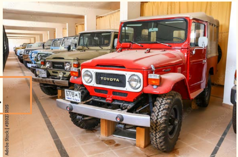
Wednesday, June 19th TOYOTA Automobile Museum <2,420 JPY>