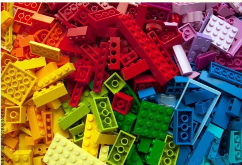
Wednesday, June 26th Legoland <5,940 JPY>