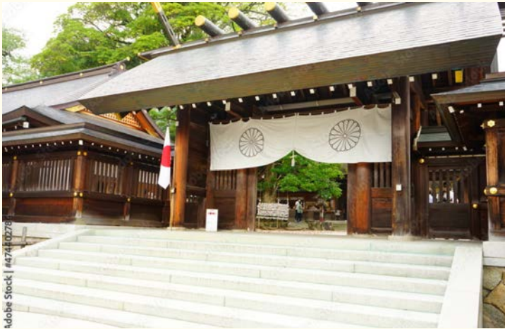
Saturday, June 15th Ise-jingu Shrine one day tour <2,620 JPY>