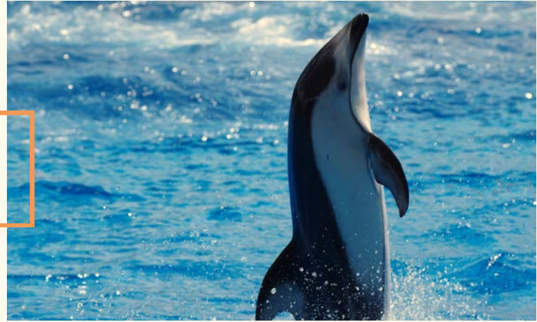
Friday June, 14th Port of Nagoya Public Aquarium <2,570 JPY>