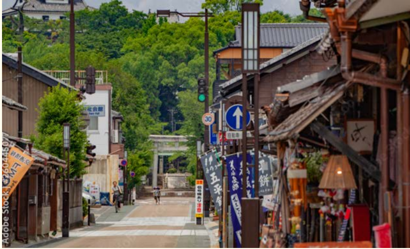
Wednesday Saturday, 22nd Inuyama Castle & Inuyama Monkey Park Tour <3,260 JPY>