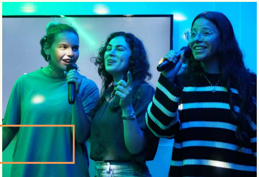
Monday, June 24th Karaoke Competition <1,100 JPY>