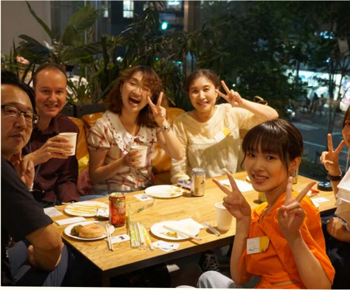
Friday, June 28th International Party <2,500 JPY>