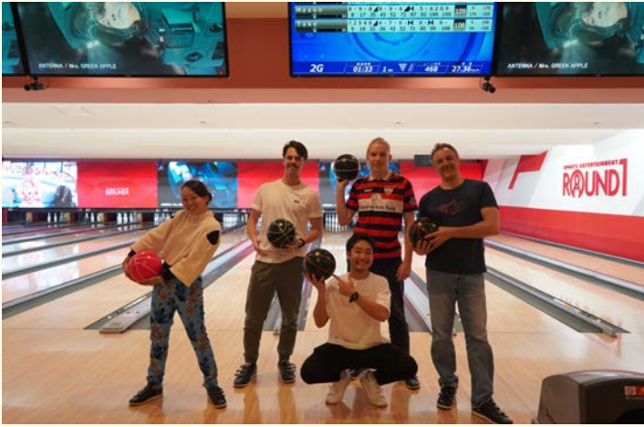
Wednesday, June 12th Bowling match! <2,300 JPY>