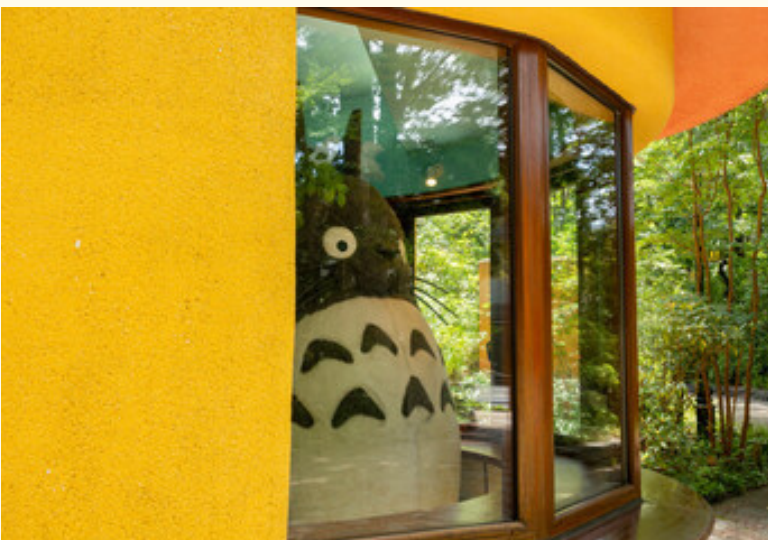
Saturday, July 6th Ghibli park! <4,340 JPY>