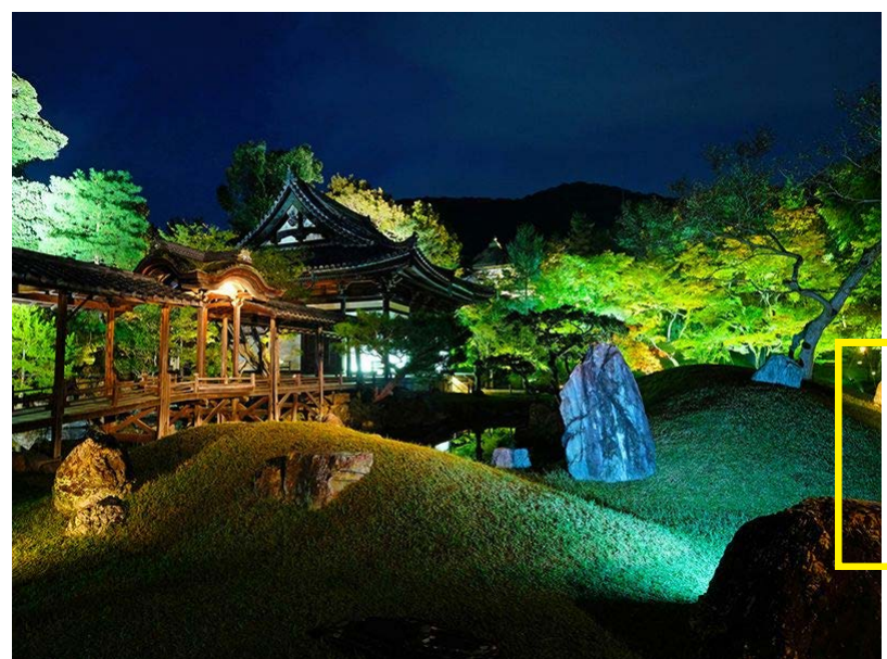
Friday, Aug 9th Let's go to Kodaiji Temple for special evening viewing < 940 JPY >