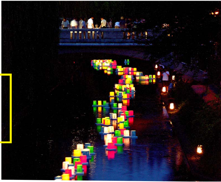
Saturday, August 10th Ceremony in which paper lanterns are floated down a river < 1,560 JPY >