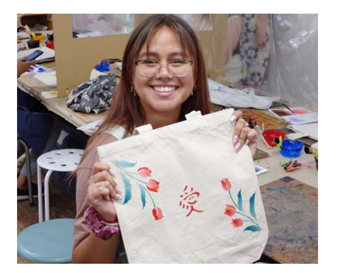
Tuesay, July 23rd Kyoyuzen doth dyeing experience