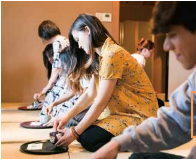
Tuesday, June 18th Tea Ceremony Experience