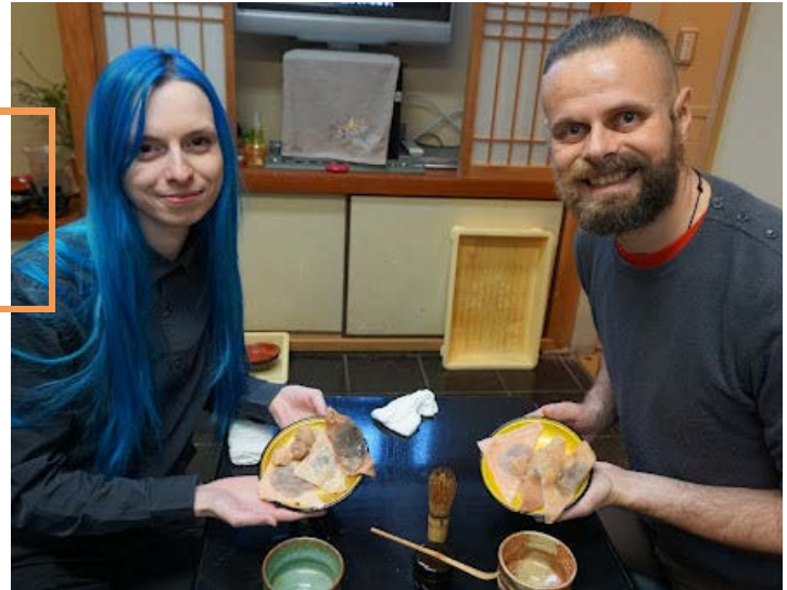
Tuesday, June 25th Japanese Sweet Making Experience