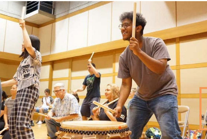
Thursday, June 27th Japanese Drumming Experience