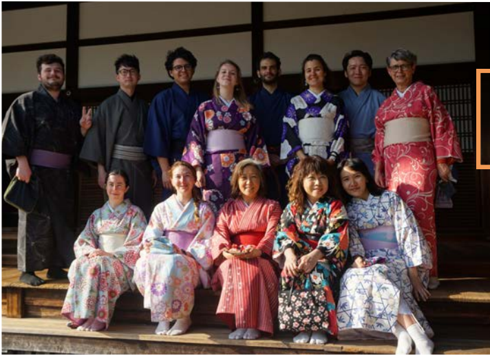
Thursday, June 20th Kimono Experience